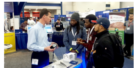
Engaging with customers