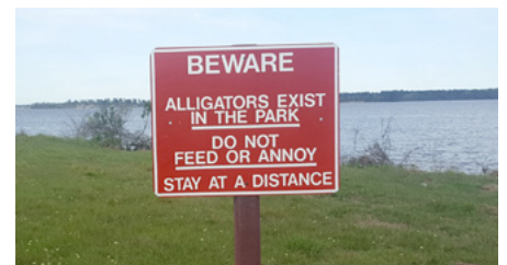
"Apparently not all visitors are as friendly as those going to the Houstex Show!"

'This is just what I need!', 'you can supply it in that form', 'really, delivery is that quick' ...these are just some of the comments our representatives received when AWI exhibited at Houstex 2017 earlier this month.