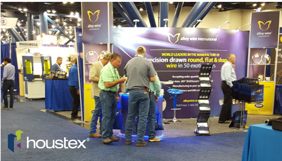
The exhibition stand doing its job